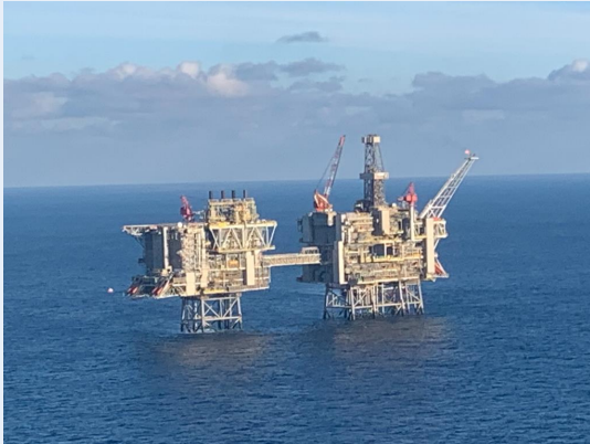
LOOKING NORTH (T)