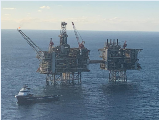
LOOKING SOUTH (T)