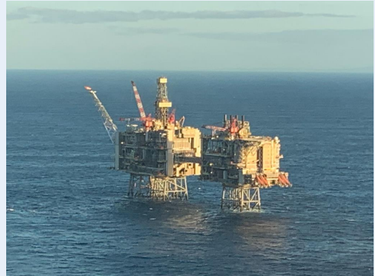
LOOKING EAST (T)